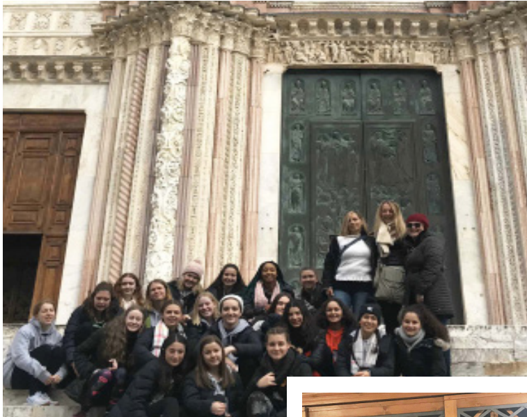
Italian Study Tour Participants