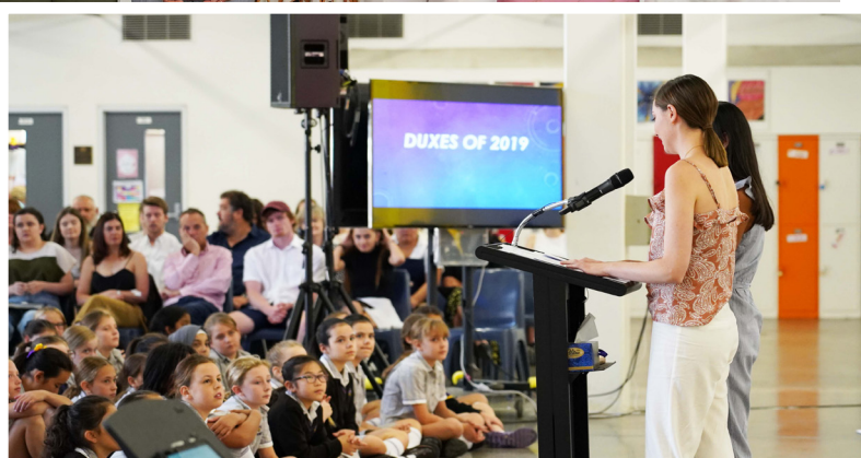
Our two Duxes delivering their inspiring speech

At SAC, teachers develop this passion for reading in collaboration with the staff of the Catherine McAuley Library. The library was abuzz with romance on Valentine's Day, celebrating a love of books. Library Lovers' Day profiled the importance of school libraries as centres of learning. In the primary classes, students read picture books about love, made heart bookmarks and fell in love with new books to borrow. Older classes had "blind dates" with books and chose beautifully wrapped surprise books to take home and uncover something new to read. The creativity of our library staff constantly encourages our students to engage with literature in new ways.