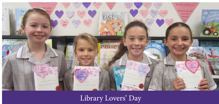
Library Lovers' Day

At SAC, teachers develop this passion for reading in collaboration with the staff of the Catherine McAuley Library. The library was abuzz with romance on Valentine's Day, celebrating a love of books. Library Lovers' Day profiled the importance of school libraries as centres of learning. In the primary classes, students read picture books about love, made heart bookmarks and fell in love with new books to borrow. Older classes had "blind dates" with books and chose beautifully wrapped surprise books to take home and uncover something new to read. The creativity of our library staff constantly encourages our students to engage with literature in new ways.