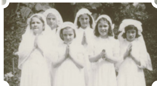
In 1920, the Sisters of Mercy purchased Barr Smith