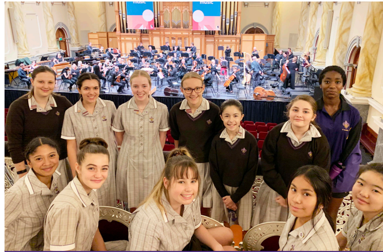
SAC Orchestra members at the ASO's Rehearsals Unwrapped