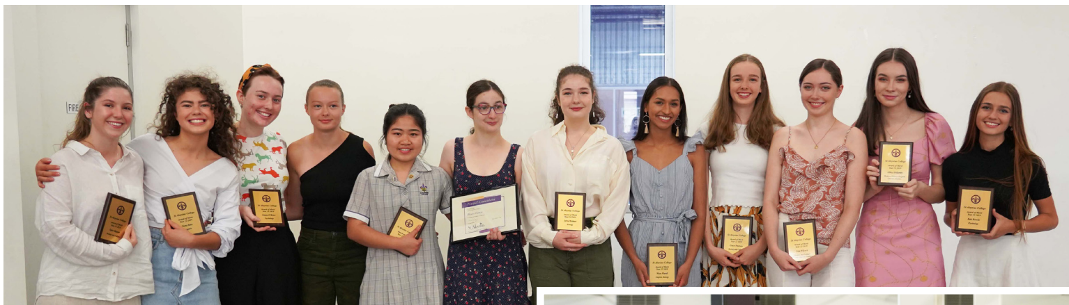
2019 Merit Awards Presentation

Of the 17 Merit Awards presented at Monday's Assembly, five were awarded for English or English Literary Studies. We know that strong literacy skills underpin great educational outcomes, and I thank all the teachers and support staff from Reception to Year 12, in English and English as an Additional Language, who foster literacy and develop a passion for reading. Their impact is beyond measure.