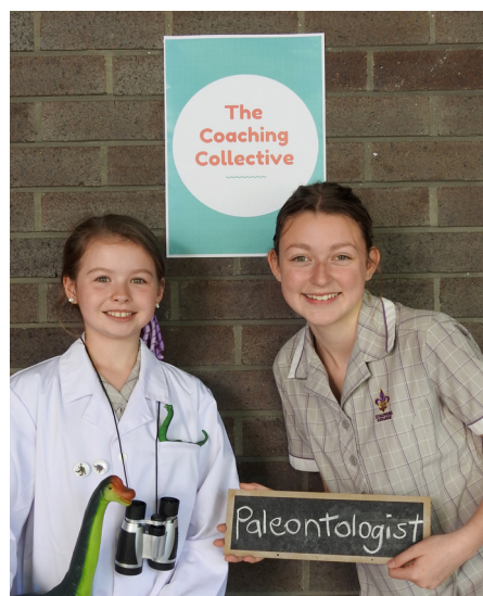
The Coaching Collective

Last weekend's Careers lift out in The Advertiser featured a story about The Coaching Collective, a program launched last year to link Year 3 and Year 8 students in learning about various career pathways. We value students learning together and respect their capacity to teach one another. By challenging gender stereotypes around careers we ensure that students of all ages are aware of the full spectrum of opportunities available to them.