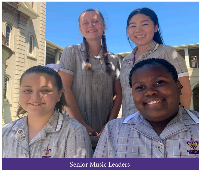
Senior Music Leaders